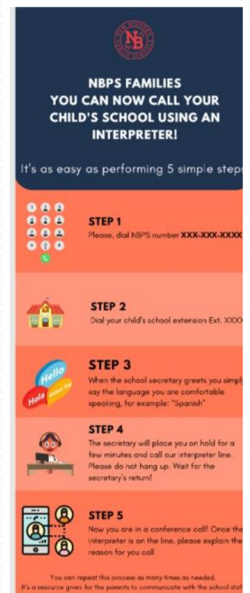
Sample— Parent flyer