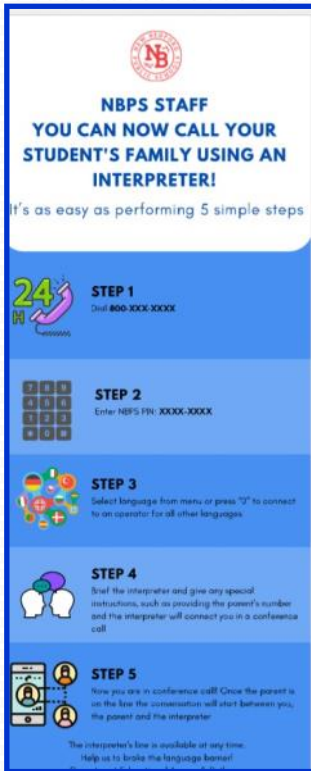
Sample— Staff flyer

NBPS now has an interpretation line to facilitate two-way communication between our schools and parents! This interpretation line, a high-quality telephone interpretation service provided by Lionbridge, is used for parents to connect with Teachers/School. Interpreters are fast and professional over the phone, and make interacting simple.